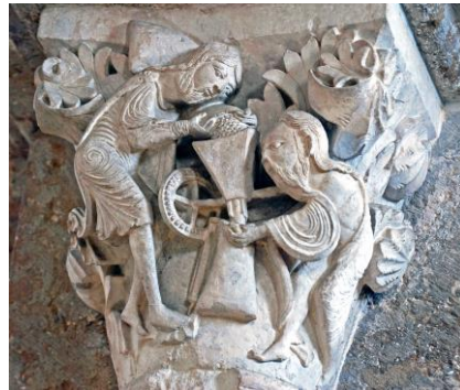
Mystic Mill Capital, Benedictine Abbey Church of Sainte-Marie-Madeleine (Vézelay, France (12 th cent. AD))