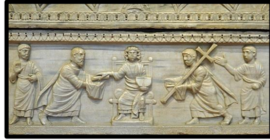
Sarcophagus of the Twelve Apostles Ravenna, Italy (AD 5 th century)

12 For before certain men came from James, he was eating with the Gentiles; but when they came, he drew back and separated himself, fearing the circumcision party.