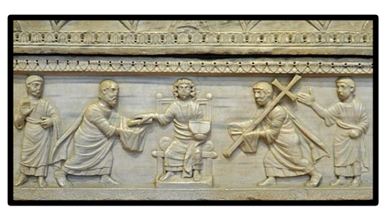
Sarcophagus of the Twelve Apostles Ravenna, Italy (AD 5<sup>th</sup> century)