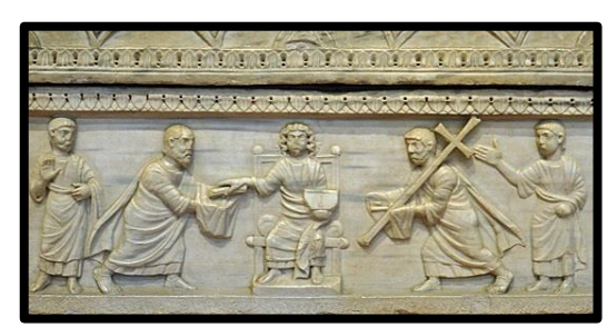
Sarcophagus of the Twelve Apostles Ravenna, Italy (AD 5<sup>th</sup> century)